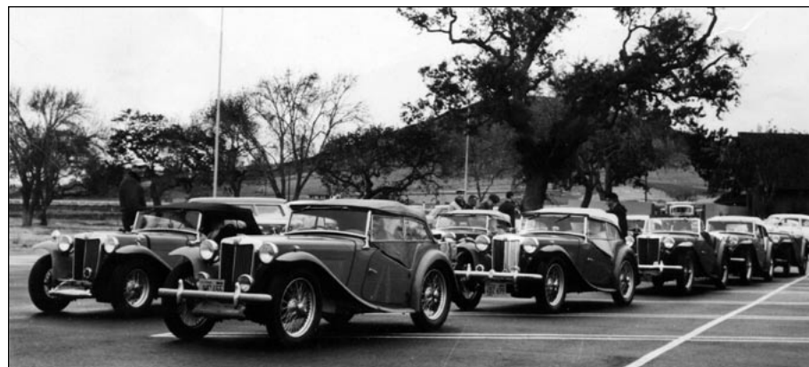
This is the line-up of TCs ready to caravan out to the 1961 TCMG/ARR Conclave at San Simeon that year. The cars sport the old yellow and black California licence plates.