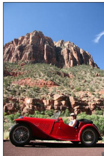
Simmon's TC at Zion National Park.