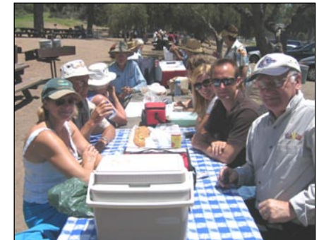
Enjoying a grand TCMG tradition - a lovely repast.