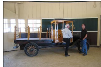
Inside the stable (above) and a photo through the window of the house (below).