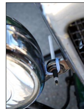
Inventive temporary repair on Olson's TC