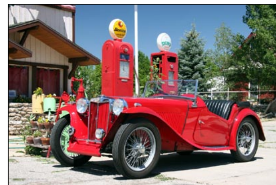
An old gas station, now a school, in Midway, Utah.