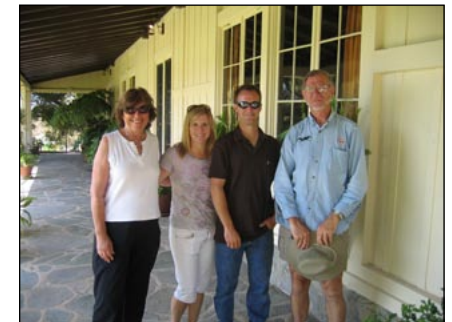
TCMGers enjoying the many things to see at the old estate.