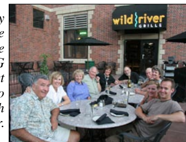
On the way home where two separate TCMG groups just happen to catch up with each other.