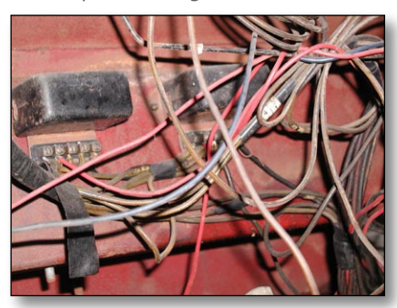
EXU signal relays (before)