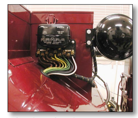
After photo of regulator area

Doug Petton 602-690-4927 or doug@fromtheframeup.com