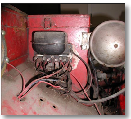
Before photo of regulator area

Summary: Decide what you need for your car. Then tell the supplier. If a stock harness works then OK. If you are asking for something non-stock, that's OK too because