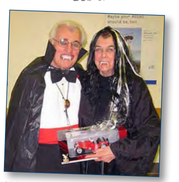
Who is this? (Hint-look left)