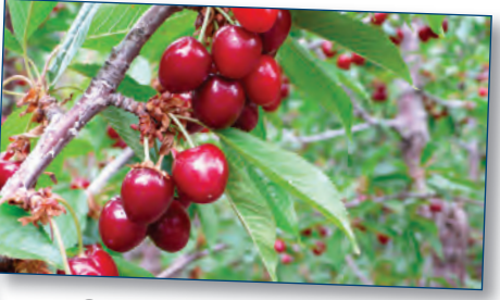
Great tasting cherries