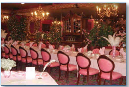
Saturday dinner at the Madonna Inn. Hope you like pink