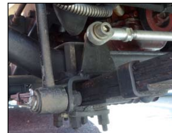
Fig.3 Shows end where it attaches to shock link plate.