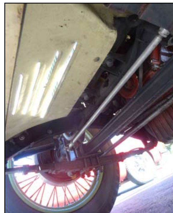
Fig.1 Shows installed Panhard rod.