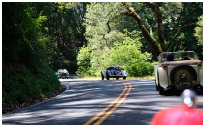
Page, Gaston (TF) and Thelander enjoying a drive along the Shoreline Highway near Woodville.