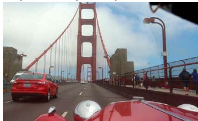
Crossing the Golden Gate, even on a foggy day, in an open TC has got to be an experience of a lifetime.