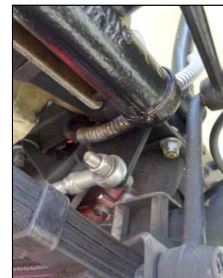
Fig.2 Shows end where it attaches to frame at buffer pad.