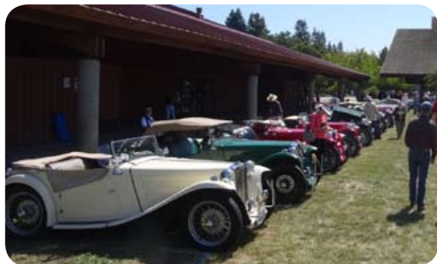
Thirty one TCs registered for this year's GoF West where TCMG & ARR members took the top awards.