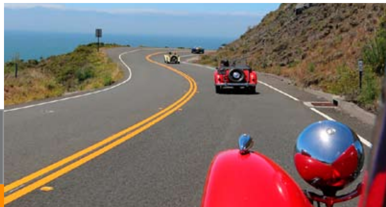
A mixed band of T-types tackle curvy Highway 1 on the way to GoF West 2015 in Rohnert Park, California.