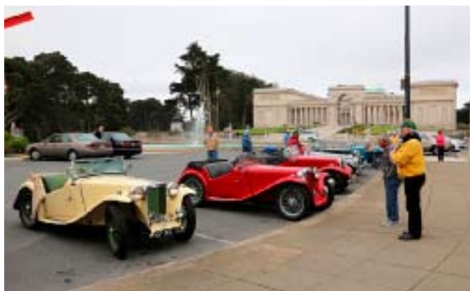
The group takes a rest stop at the Legion of Honor, one of the Fine Arts Museums in San Francisco.