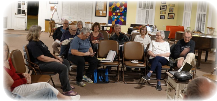
Just some of those present at the meeting that night.