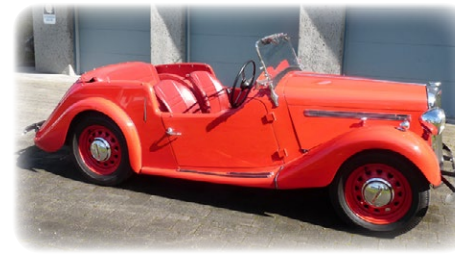
1954 Singer Roadster similar to this one was bought for $70 (#4).