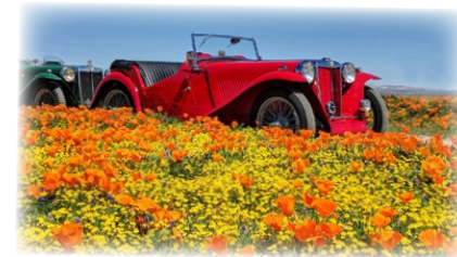
Beautiful TC and beautiful flowers