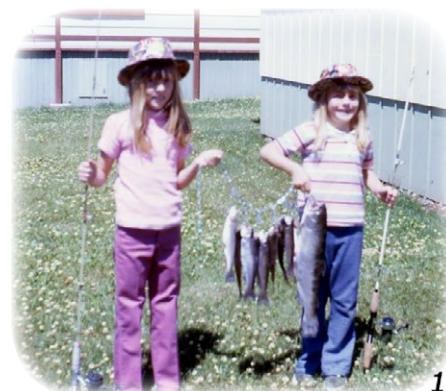
Girl on the right side with 21" trout next to her is our member