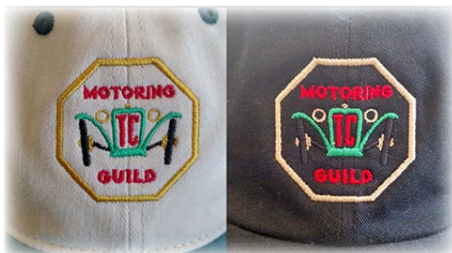
Vintage cap design