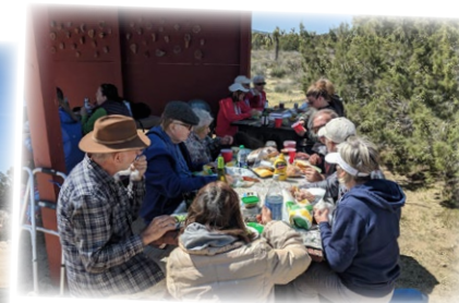
Enjoying a picnic lunch together