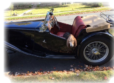
His basset hound in the TC on a Fall day

He likes the 4 seasons and will take the cold weather and snow over the desert any day. He recalls working in New Mexico during the ‘50s while in the Army when stationed in the desert of New Mexico for about a year and a half. They were firing and testing guided missiles and remembers seeing 140° quite often, and in Army uniforms that’s HOT.... Also recalls the sand storms.