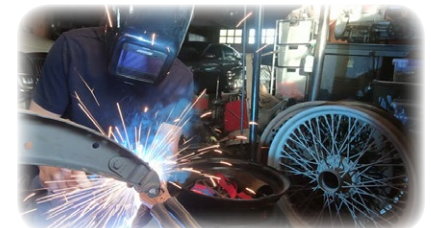
Performing repair welding