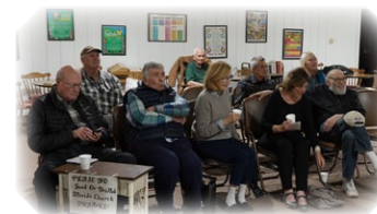
Some of the members present

She is willing to assist in preparing photos, etc. for any such presentation.