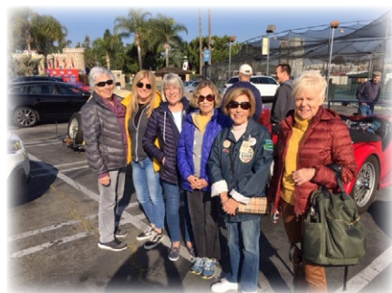
TC ladies ready to play golf