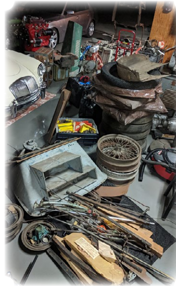
Laying out and sorting all the pieces

was straight. The string method showed that it was close but not quite perfect, and when the front cross tube was removed, the frame rails sprung out at an angle. So