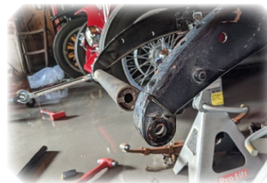
Front tip misalignment