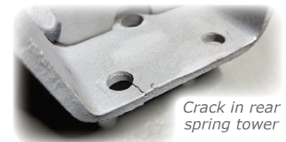
Crack in rear spring tower