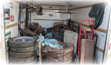
Filling up the U-Haul

10 The first task was getting it all into a