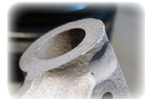
Large divot in front axle eye