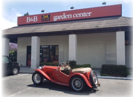
Rob Zucca came across this B&B Garden Center