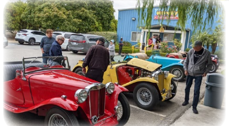
Buying tasty treats at the Honey Farm before going to the next stop.