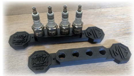
TCMG Spark Plug Holders

Please specify style and color (where applicable) when ordering. Alternate colors may be available upon request. Inquire for details.