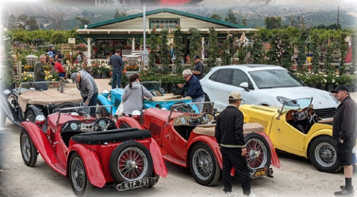
At the large nursery for a bite to eat, walk around and a chance to buy flora.