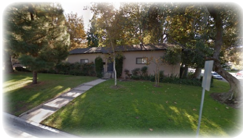
2534 Hollister Ter and what seems to be a community center at Glenoaks Park

It was August 1954, and the newly formed TC group had a plan. The meeting held two months prior at the Glendale offices of Road & Track Magazine had gone well, with much accomplished by the time they adjourned. The group had agreed to locate a permanent meeting hall and meet there on one Friday night each month. The location they found was East Glenoaks Manor, located at 2534 Hollister Terrace in Glendale, just a few miles up the hill from R&T.