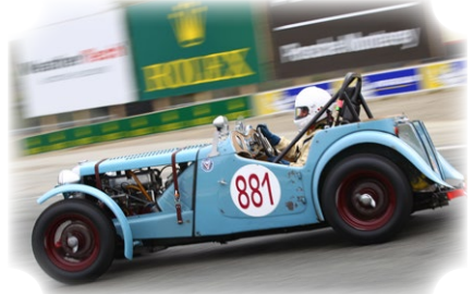
Racing at Monterey in 2018

I also have a 1966 MGB that is also a race car as well as a 1971 MGB-GT that is a road