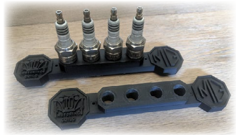
TCMG Spark Plug Holders

Please specify style and color (where applicable) when ordering. Alternate colors may be available upon request. Inquire for details.