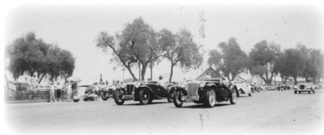
Photo of 2nd TCMG group tour