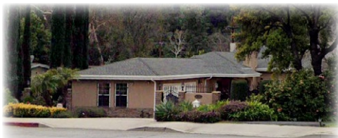
3813 Pennsylvania Ave (Google view)

the club. Whether this was an election or a volunteer process is not clear. The full list of officers for 1954 was as follows: