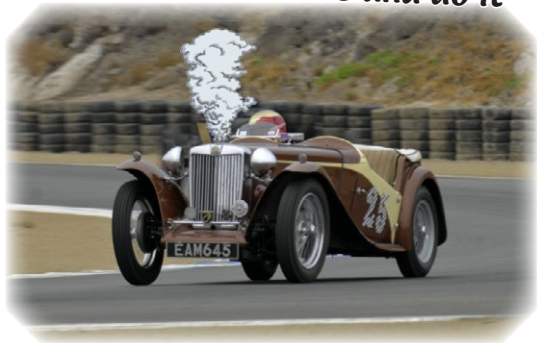
TC doing a hot lap with hot radiator

Time is running out, so get out there and do it