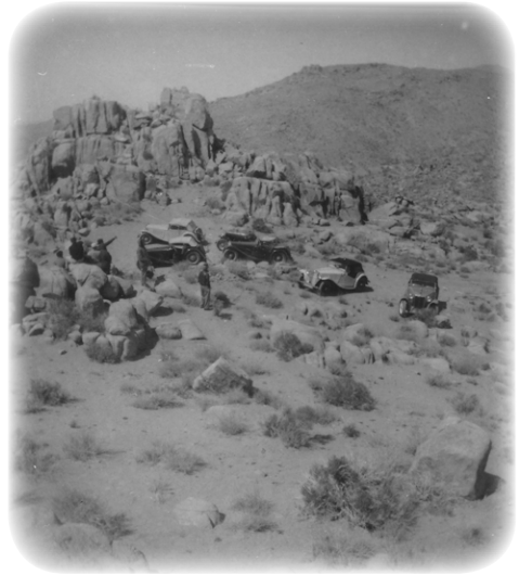
Six TCs at Apple Valley and it appears they drove up a hill on a dirt road. Note that of the six TCs, four have their tops up probably for warmth. Many of the people are wearing coats.

More importantly, it was at this meeting that the first official TCMG group tour was planned. It was held on Sunday, March 20, 1955 starting at the McGuire home with a destination of Apple Valley for breakfast (and possibly a picnic lunch), then home again.