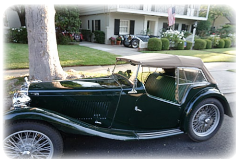
5 TCs at the meeting - Loe, Zucca, Simmons, Edgar and Spiegel

24 total in attendance representing 14 memberships.