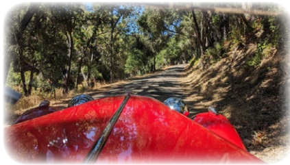
A view of just some of the wonderful back roads