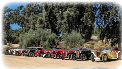
Line up our toys at Pasolivo