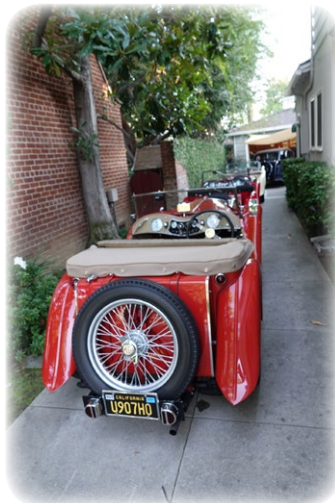
3 TCs in the driveway plus the gorgeous SA