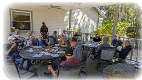
Learning all about olive oil at Pasolivo

On Monday the swarm of TCs headed out for a scenic driving tour through the twisty roads of Central California's Wine Country before stopping for a gourmet olive oil tasting experience. We learned quite a bit about quality olive oil. The TCs had more olive oil (and related products) in them than motor oil by the time we left, but not before the beautiful location convinced us to take our lineup photo early rather than waiting for the following morning as we usually would. After a bit more scenic touring, the pack found its way to a facility that restores WWI-era aircraft. A tour of the various hangers and buildings presented dozens of early aircraft, automobile and boat engines, a car collection, wooden boats and more.