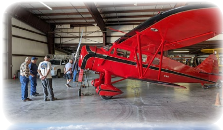
Just a sampling of aircraft and other toys at Antique Aero