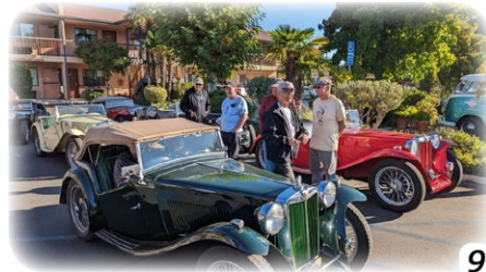
Gathering to head home Tuesday morning