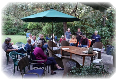
Very pleasant evening at the Spiegel home