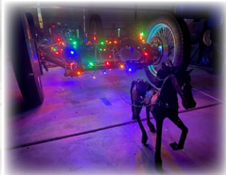
Gorden & June