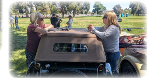
Getting ready to head home and sharing good-byes