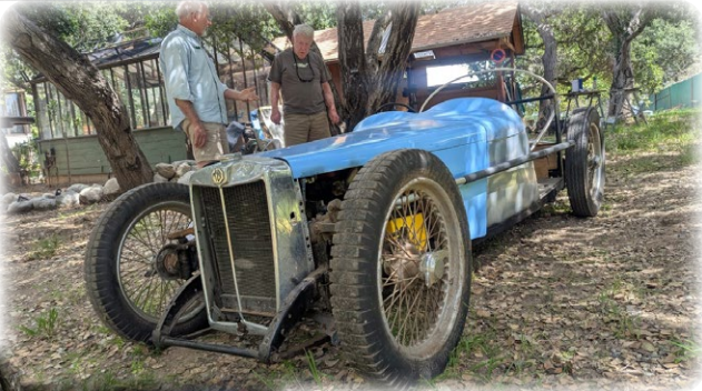
Gene's low-rider TC (not much taller than the wheels) Quite the project. Far from stock but very interesting and it helps keep him out of other trouble (grin).