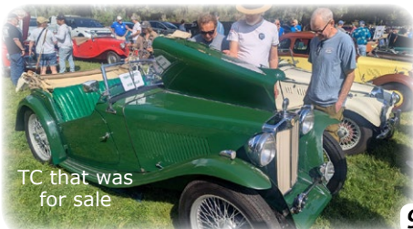
TC that was for sale