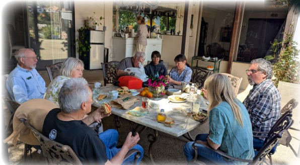
Doing what we do best, eating and talking TCs