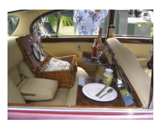
The Rolls folk prefer inside dining.