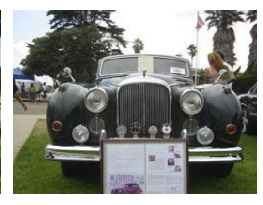
Quiz: How many circles can you find? (see page 5 for larger)