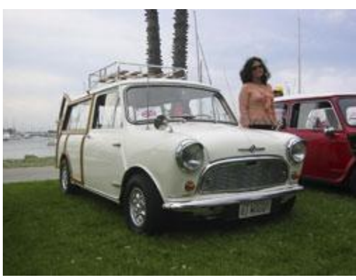
Especially this perfect little woodie.....