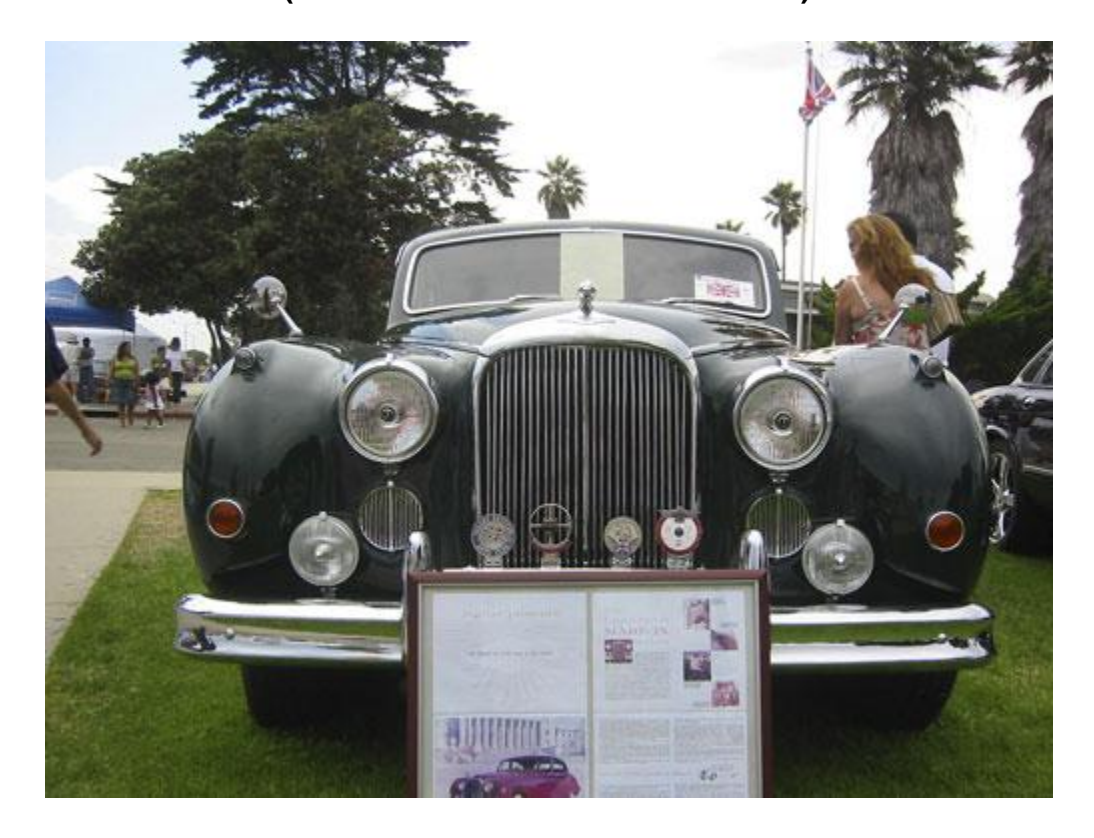
See next page for answer...