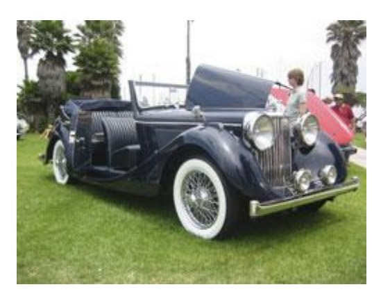
A truly classic Jaguar .....