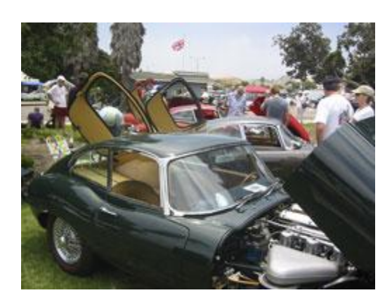
The Jaguar XKE marque was well represented but