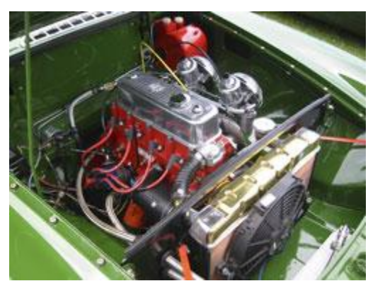
An upgraded B engine installation.....