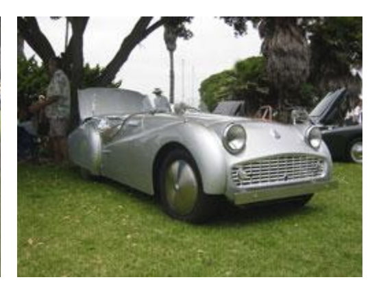
The TR3s put Triumph out front in the A very customized TR3a impressed the Oxnard locals.