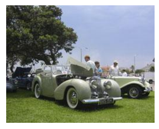
One of my alltime favorites...the 1948 Triumph.