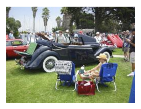
The proud owner takes a picnic break.