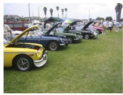
Look! Now they've got the MGBs doing it.