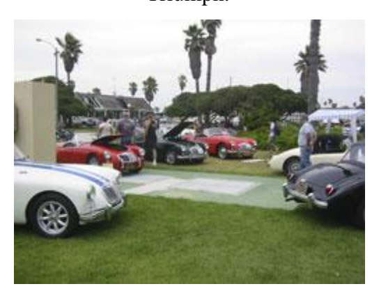
The MGA lineup was more than respectable.