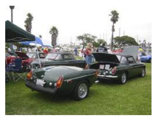
What's this? An upgraded B luggage compartment...