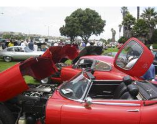
it would be nice to see a few with the bonnets down.