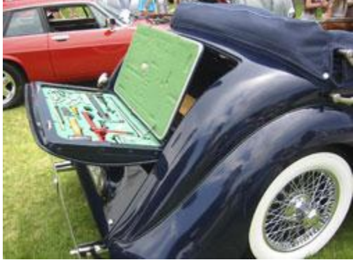
....with a pristine, seldom-used tool box.