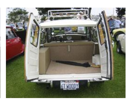
..with room enough for a king-sized English umbrella.