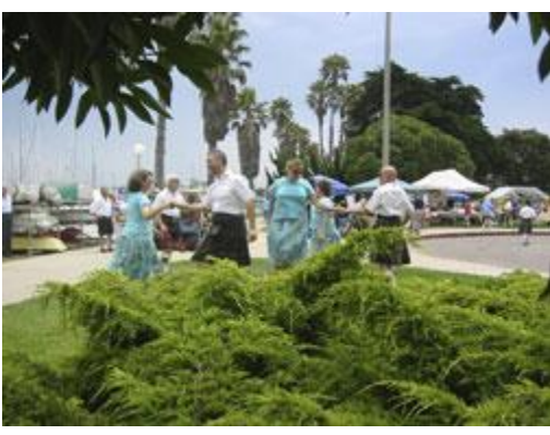
A Scottish dance troup demonstrates a reel (or jig?)