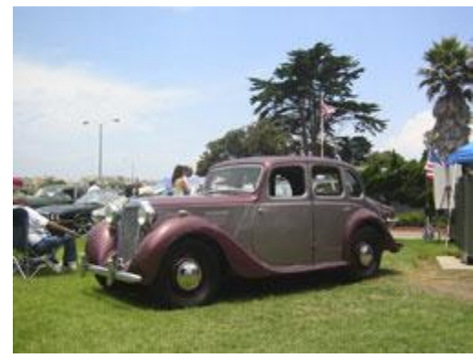
Custom MGA coachwork with a small It was nice to see an absolutely original Y-type saloon.