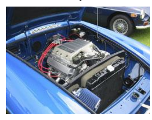
And a <u>very</u> upgraded 3.1L GMC V6 @ 240 hp.