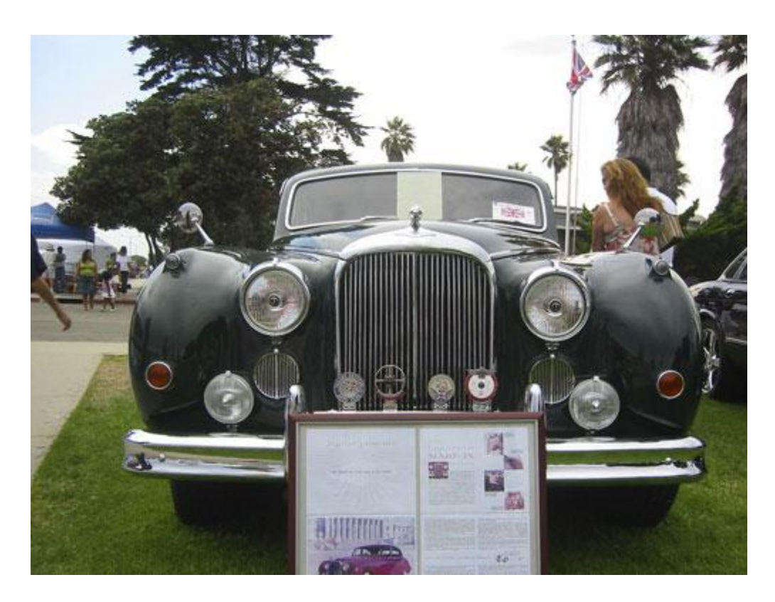
I counted 18 circular shapes on this classic Jaguar.

(Don't forget the two bolts on the bumper.)